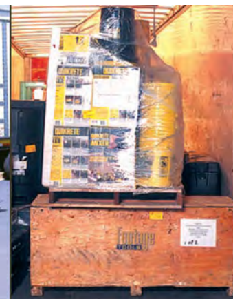
Constricted Space Loading