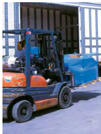
Side Door Loading