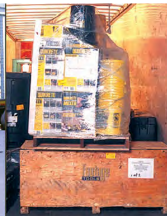
Constricted Space Loading