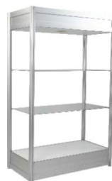
Présentoir vitrine Showcase 40" x 20" x 80"H 20" de large aussi disponible / 20" wide also available