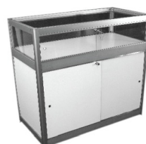
Comptoir vitrine Showcase counter 40" x 20" x 40"H