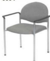
Fauteuil tissu gris Armchair grey fabric