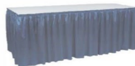
Table avec jupe Draped table 72" x 24" x 30"H Table avec jupe Draped table 48" x 24" x 30"H

Disponible 42" haut / Available 42" high