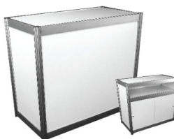
Comptoir, portes coulissantes Counter with sliding doors 40" x 20" x 40"H