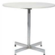
Table Table 30" x 30"H