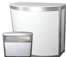
Comptoir courbé, portes coulissantes Curved counter with sliding doors 40" x 32" X 40"H