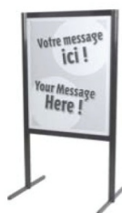
Porte affiche Sign holder 60" H