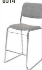
Tabouret tissu gris High stool grey fabric