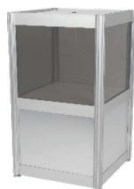
Boîte de tirage Raffle Box 18,5" x 18,5" x 40"H