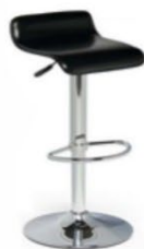
Tabouret Alice Alice Stool