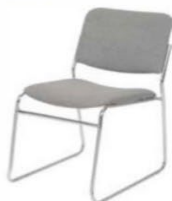
Chaise tissu gris Side chair grey fabric