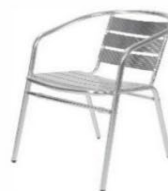
Fauteuil aluminium Aluminium armchair