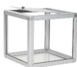
Boîte de tirage pour table Raffle cube for table 12" x 12" x 12"H