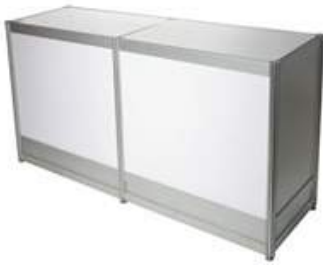
80" Storage Counter