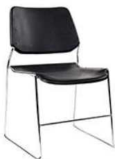
Plastic Contour Chair