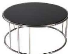
32" Round Coffee Table (black, red or white)