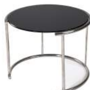
24" Round End Table (black or white)