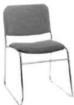
Grey Fabric Side Chair