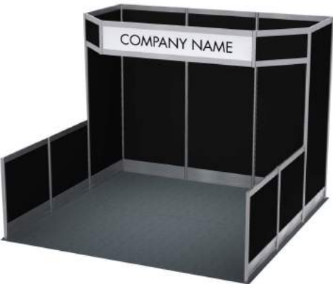
Package A - 10' x 10'