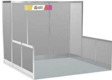
48"w x 8"h Booth ID Sign