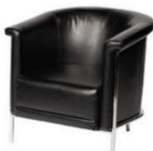
Round Leather Tub Chair (black or white)