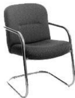
Grey Lounge Chair