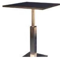
Square Cocktail Table