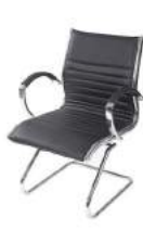
Leather Ripple Sled Base Chair