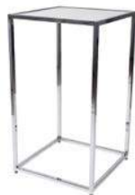
Chrome/White Cocktail Table