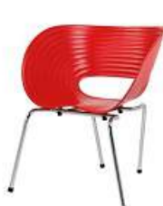
Round Meeting Chair (black, red or white)