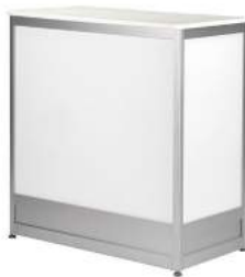
Counter Storage Unit