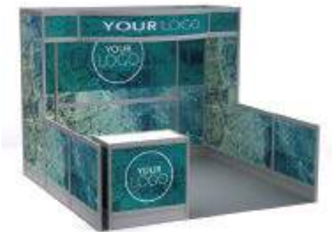
Model 1 - 10' x 10'