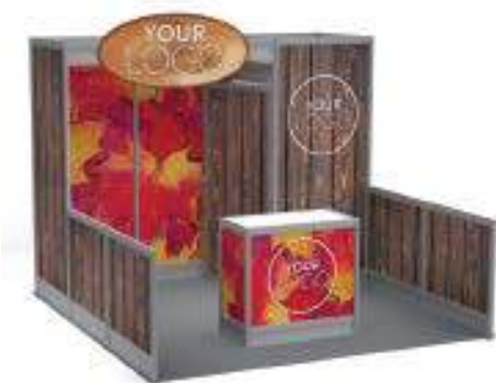
Model 2 - 10' x 10'