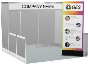
38"w x 96"h Vertical Sign with Stand