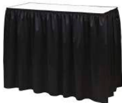
Skirted Counter - 42" High 4ft., 6ft.