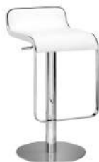
Equino White Stool