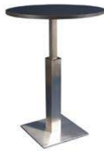
Round Cocktail Table