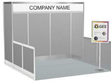
22"w x 28"h Vertical Sign