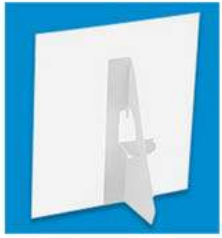
8"w x 11"h Vertical Sign with Easel

The addition of graphics to your booth will catch the eye of visitors, drawing them out of the aisle and in to your space.