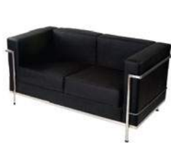
Corbusier Leather Loveseat (black red or white)