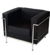
Corbusier Leather Chair (black, red or white)