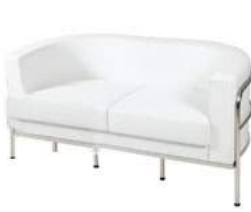
Sculpted Leather Loveseat (black red or white)