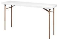
Unskirted Counter - 42" High 4ft., 6ft.