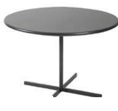
42" Round Meeting Table