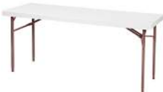
Unskirted Table - 30" High 4ft., 6ft., 8ft.