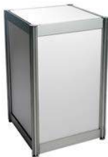
28" High Pedestal