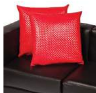
18" Throw Pillow

Colors may vary due to facility lighting, printing limitations and dye lot differences. Some items may not be available at all locations. See order form for details. Styles of items portrayed on this brochure may vary in some locations.