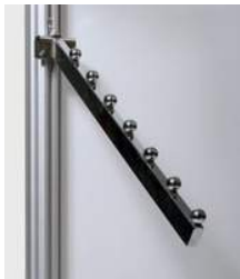
Waterfall with Hooks