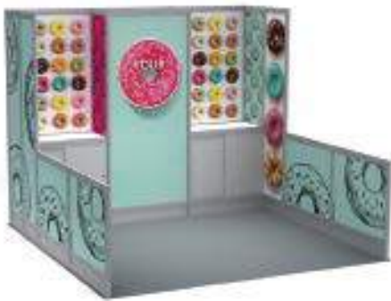
Model 3 - 10' x 10'