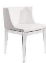
White Meeting Chair