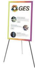
28"w x 44"h Vertical Sign