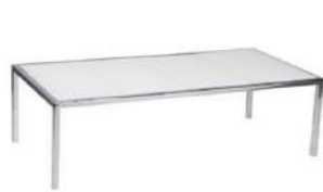
24" x 48" Coffee Table (black or white)