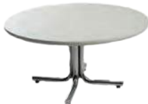
Starbase Table - 18" High