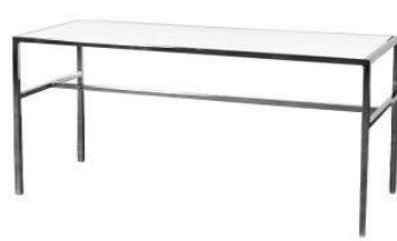
72" Meeting Table