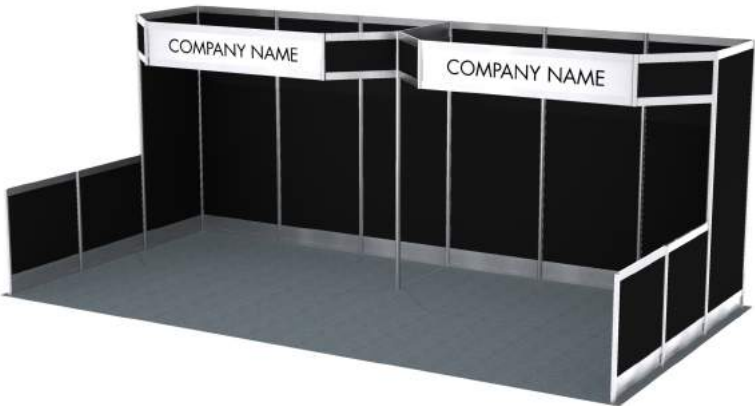
Package B - 10' x 20'