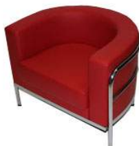
Sculpted Leather Chair (black, red or white)