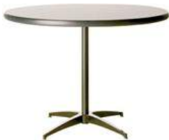
Starbase Table - 30" High