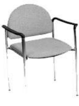
Grey Fabric Arm Chair