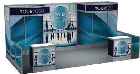
Model 4 - 10' x 20'