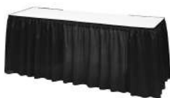
Skirted Table - 30" High 4ft., 6ft., 8ft.