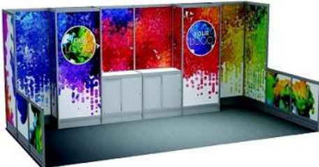
Model 5 - 10' x 20'

Colors may vary due to facility lighting, printing limitations and dye lot differences. Some items may not be available at all locations. See order form for details. Styles of items portrayed on this brochure may vary in some locations.