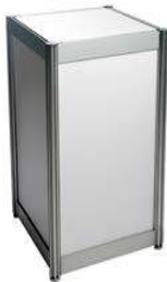
36" High Pedestal