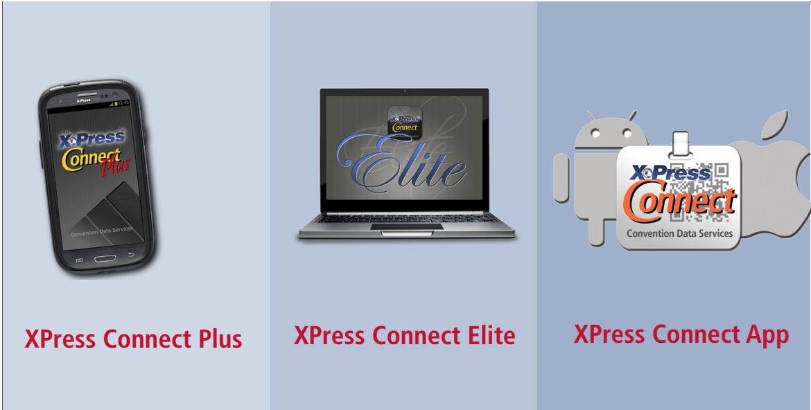
XPress Connect Plus