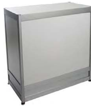
40" W x 20" D x 41" H White Counter Storage Unit