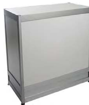
40" W x 20" D x 41" H White Counter Storage Unit