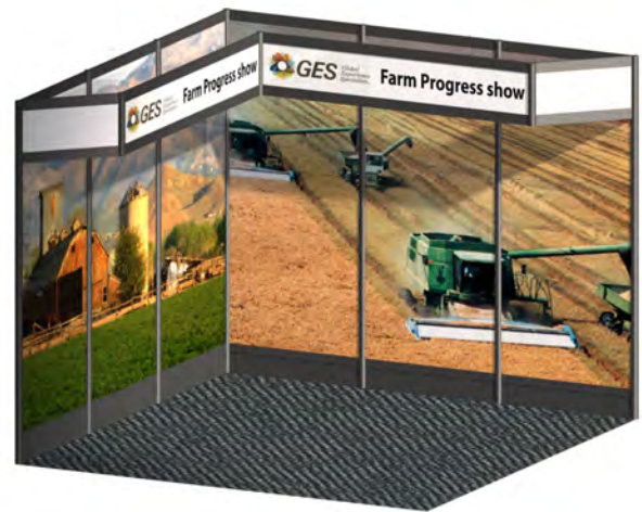
GEM Option 2

● GEM 10'x10' Inline Exhibit Booth with full graphics