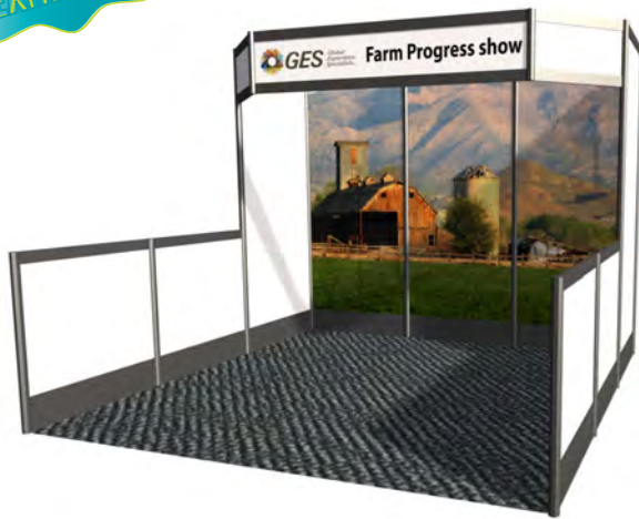
GEM Option 1

● GEM 10'x10' Inline Exhibit Booth with graphics backwall