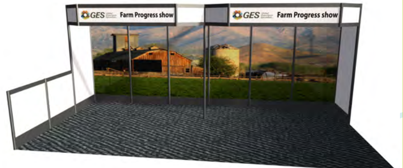
GEM Option 4

● GEM 10'x20' Inline Exhibit Booth with full graphics