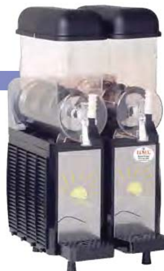
Penguin 2 Double Bowl Frozen Drink Display