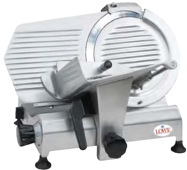
MS12 Electric Meat Slicer 12" Cutting Wheel