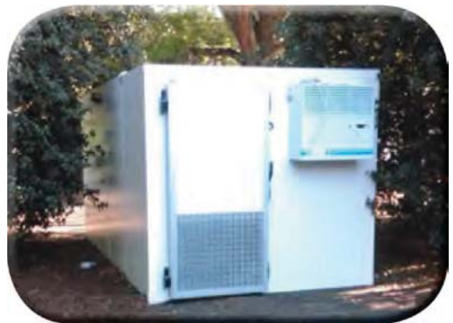
Build on a cart path or remote site with ease!