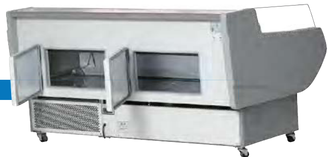
B - LG Back View