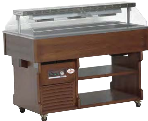
Isola 4H Lid Electronically Lowered.