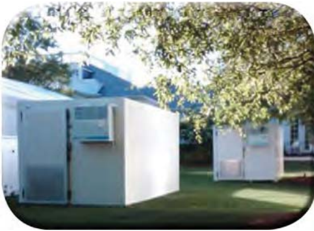
Build on pristine grass in front of clubhouse. No forklift needed.