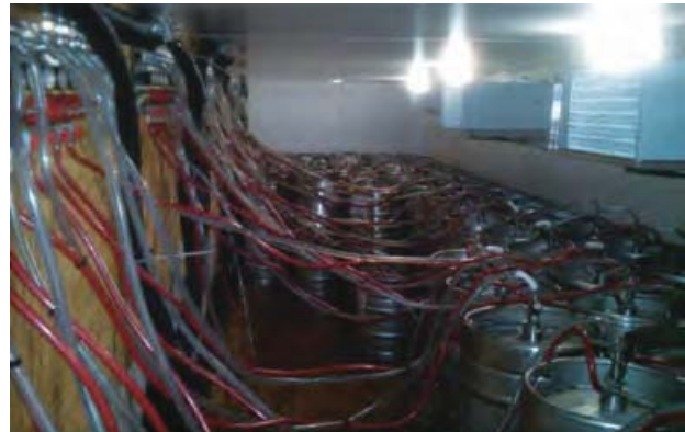
Cold Room used for keg storage.

(Note: Our offices in Europe and Asia provide a similar service.)