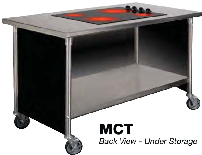
MCT Back View - Under Storage