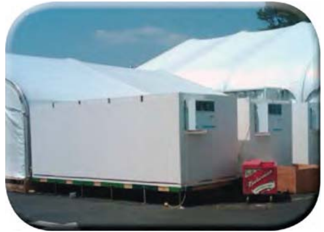
Inside or outside of any structure. No fumes. Almost silent!