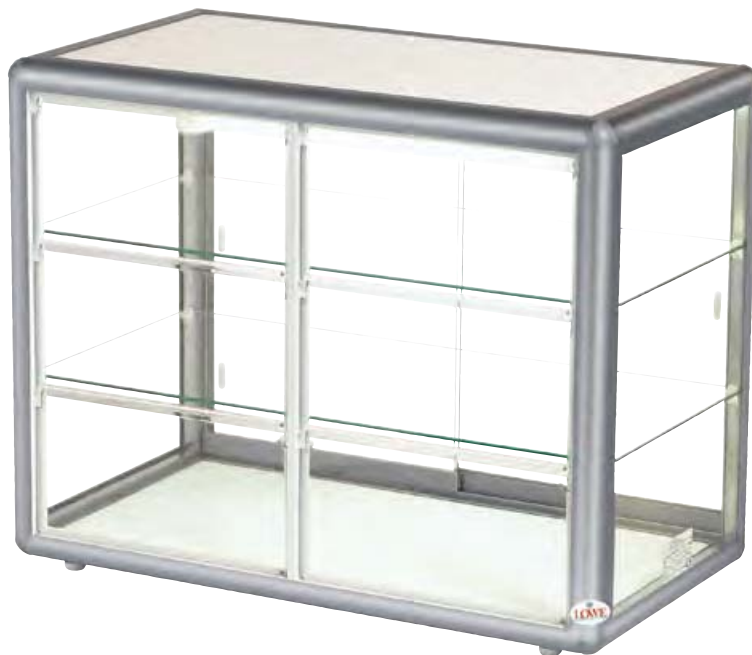
200 Dry Self-Serve Counter Top Display