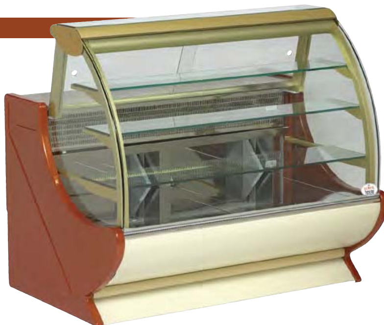
Additional Colors Available