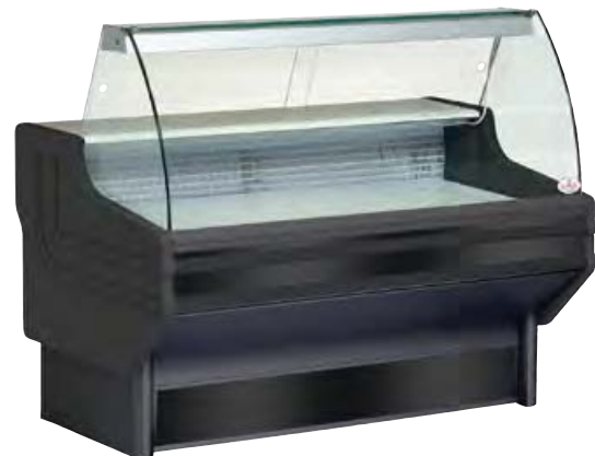
J-150 Also Available In Black