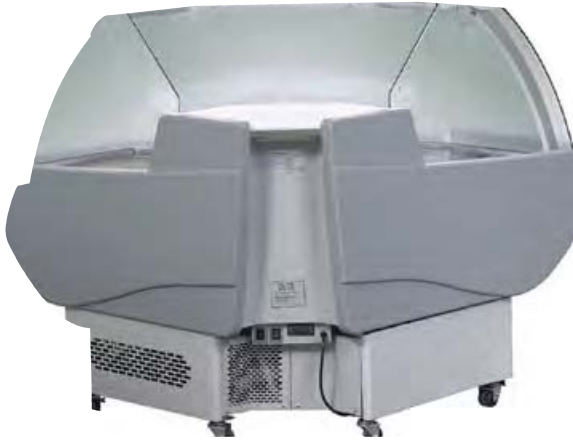
'B' Corner - Back View