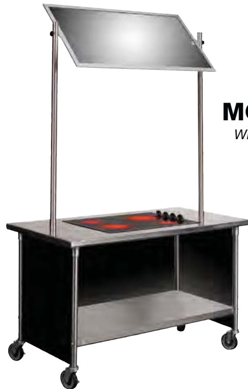
MCTM With Mirror