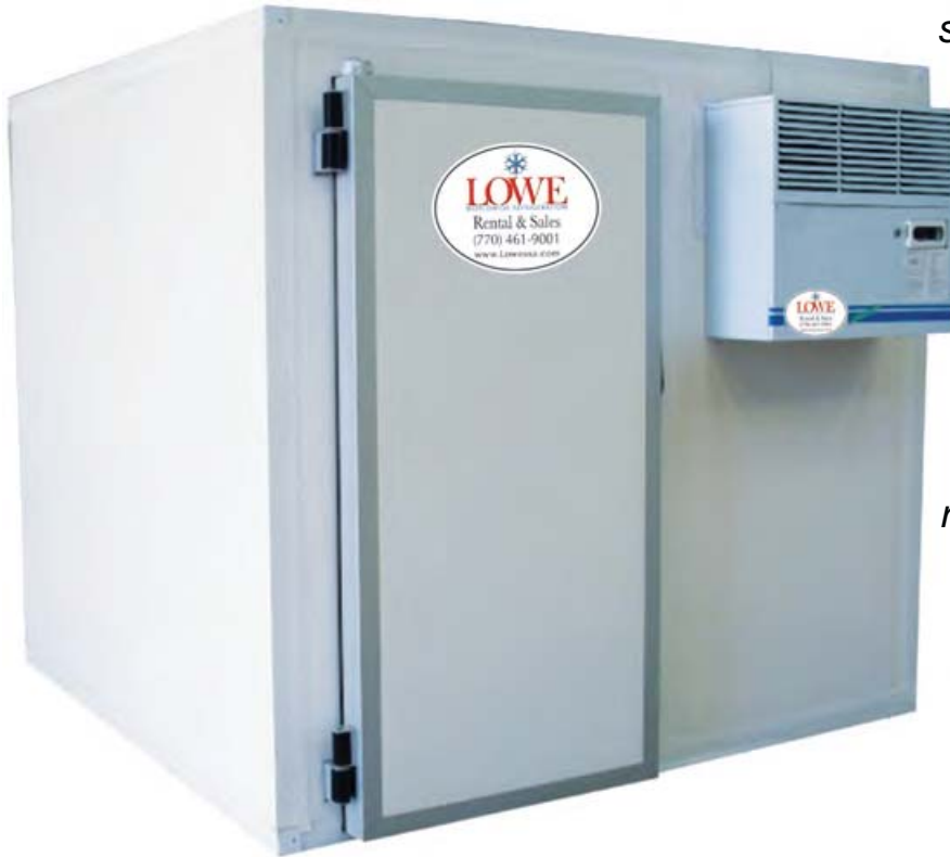
8ft by 8ft Modular Walk-in Cold Room. (smallest size available) Length can be increased in 2ft increments. Width can be increased in 8ft increments with interior walls.

Mobile & remote, climate controlled modular refrigeration / freezer cold rooms engineered for quiet efficiency even in the most challenging environments.