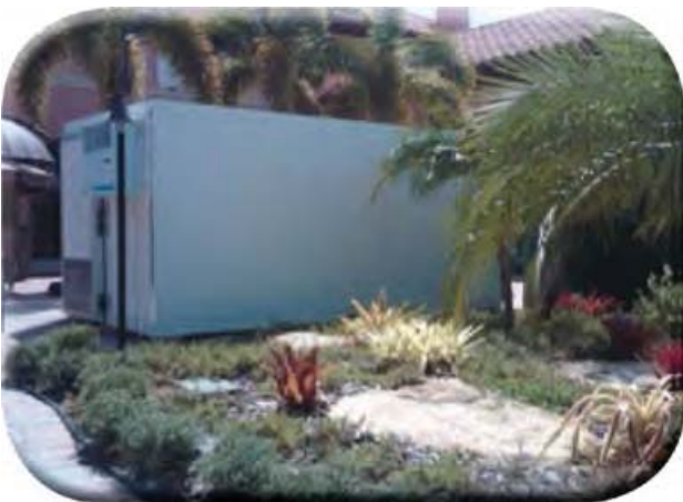
No vehicular access - no problem. Modular cold rooms can be taken through 3ft door to build inside.