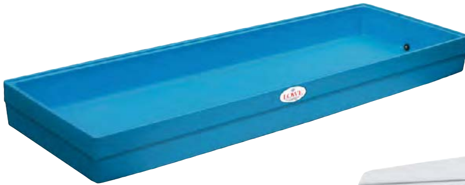
I1 / I3 Display Ice Tray