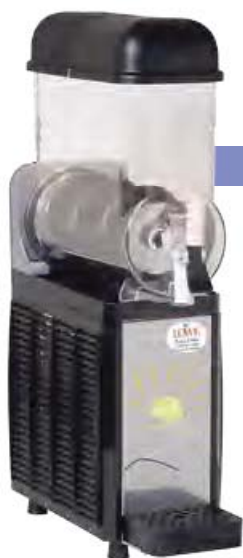
Penguin 1 Single Bowl Frozen Drink Display