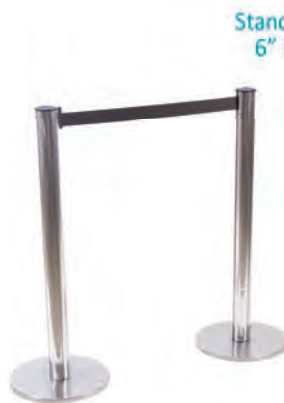
Stanchions 6" Belt