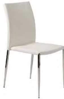
Diana Dining Chair