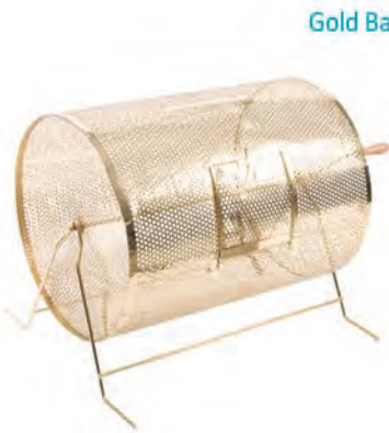
Gold Ballot Drum