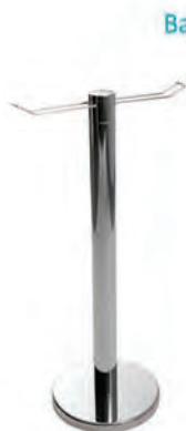
Bag Holder 41" H