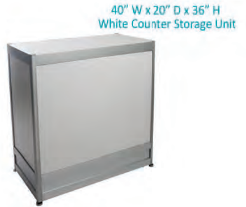
40" W x 20" D x 36" H White Counter Storage Unit