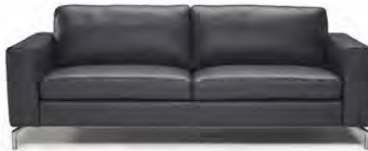
Genuine Italian Leather Sofa & Love Seat