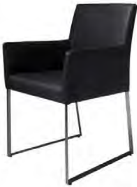
Tate Accent Chair