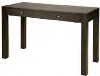
Madison Wood Desk