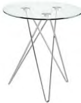
Zoey Side Table