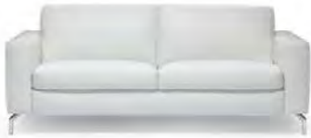
Genuine Italian Leather Sofa & Love Seat