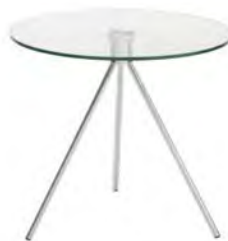
Max Side Table