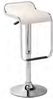
Cane Adjustable Barstool