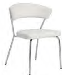
Draco Dining Chair