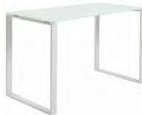
Diego White Desk