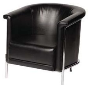
Black Round Tub Chairs

Still can't find it? For more options please contact the Exhibitor Services Department 905.283.0500