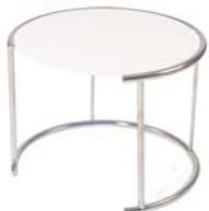
24" Round End Table White Top

Also available in 39" round coffee tables