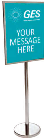
22" W X 28" H Chrome Sign Holder (sign extra)