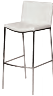
White Leather Stool