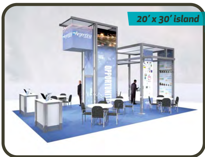
20' x 30' island