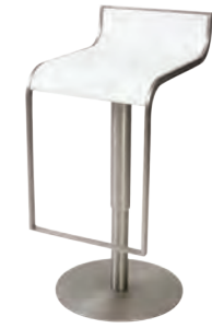
Equino White Stool