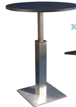
30" Round Cocktail Table Black Top