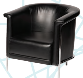
White Round Tub Chairs