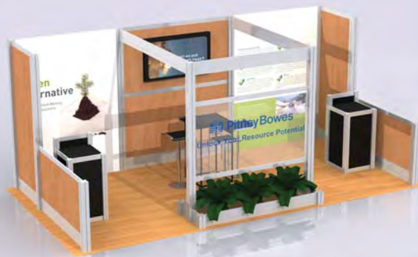
10' x 20' inline