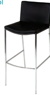
Black Leather Stool