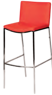
Red Leather Stool