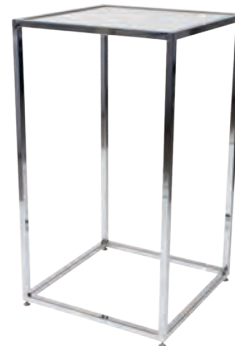
24" Square Chrome/White Cocktail Table