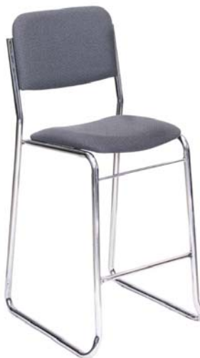
Grey Fabric Counter Stool