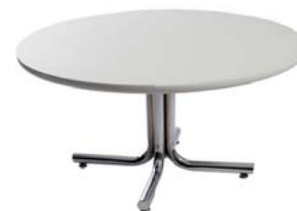
30" Round / 18" High Coffee Table