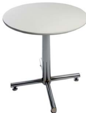
30" Round / 30" High Starbase Table