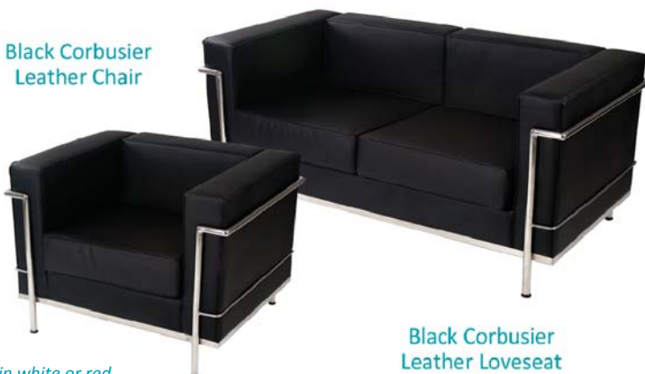
Black Corbusier Leather Loveseat