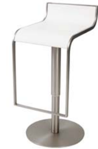
Equino White Stool