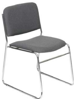
Grey Fabric Side Chair