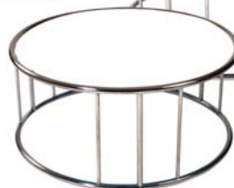
32" Round Coffee Table White Top