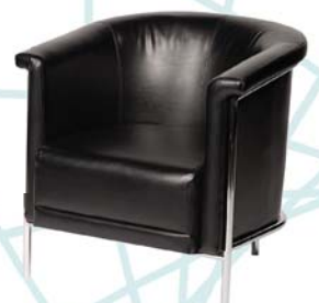
Black Round Tub Chairs