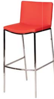
Red Leather Stool