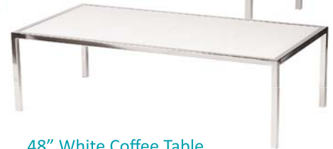
48" White Coffee Table