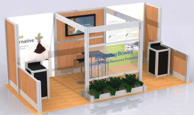
10' x 20' inline