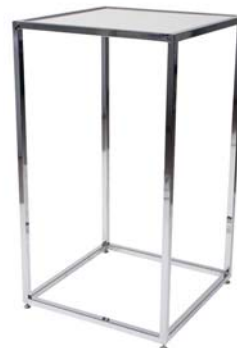
24" Square Chrome/White Cocktail Table