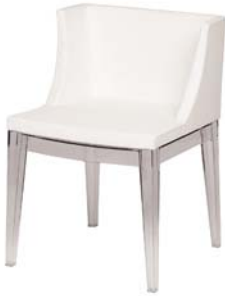
White Meeting Chair