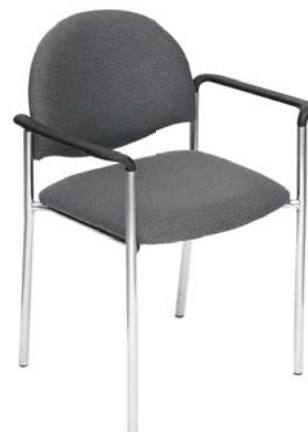
Grey Fabric Arm Chair