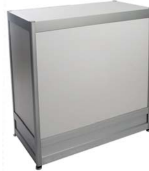
40" W x 20" D x 41" H White Counter Storage Unit