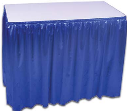
4' and 6' Long Skirted Counter with White Vinyl Top