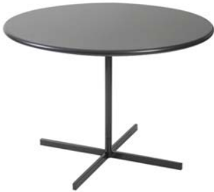
42" Round Black Meeting Table