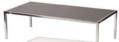
48" Black Coffee Table