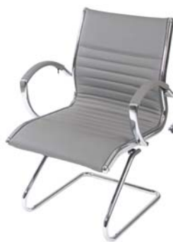
Grey Leather Ripple Sled Base Meeting Chair