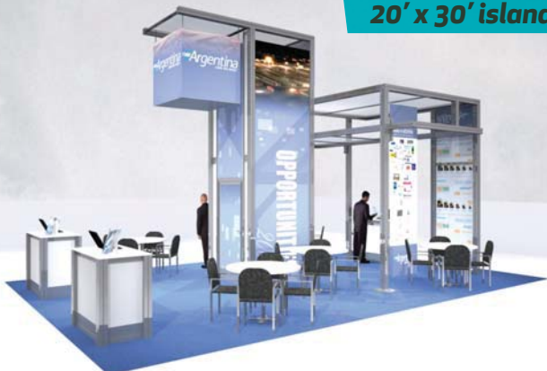
20' x 30' island