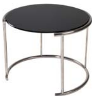
24" Round End Table Black Top