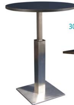
30" Round Cocktail Table Black Top