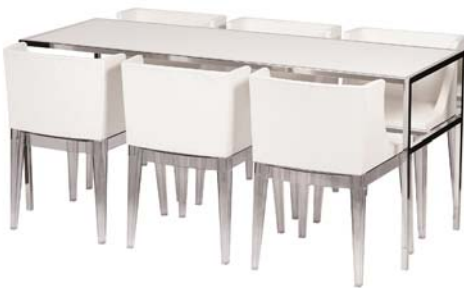
72" Chrome & White Meeting Table