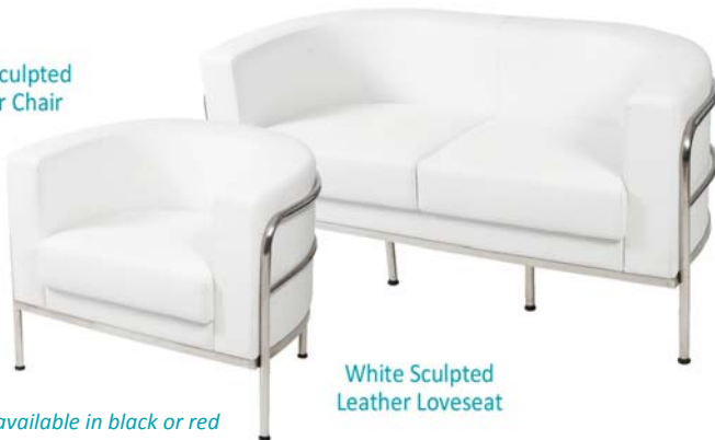
White Sculpted Leather Loveseat