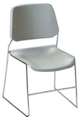
Plastic Contour Chair