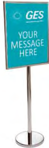
22" W X 28" H Chrome Sign Holder (sign extra)