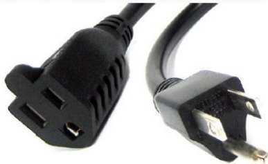
Industrial (3) Prong Cords