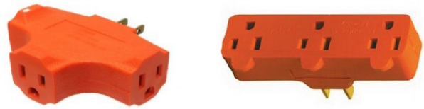
Adapters (2 or 3 prong)