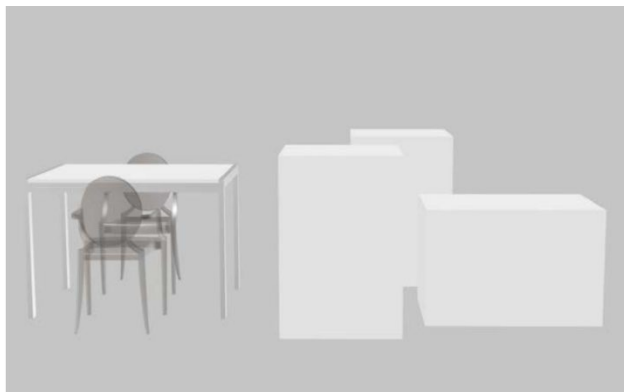
HOME, GIFT & BEAUTY *renderings are for illustrative purposes only. Slight variations may occur.

GES orders may be placed on GES Expresso before booth numbers are released. After submitting your contract, it may take up to one week for your company name to appear on GES Expresso.