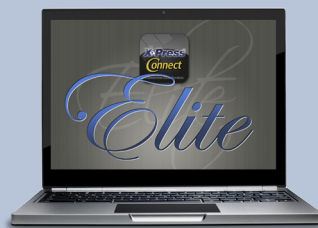
X•Press Connect Elite