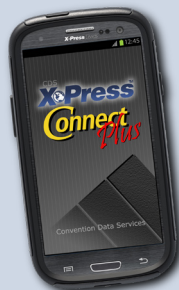
X•Press Connect Plus