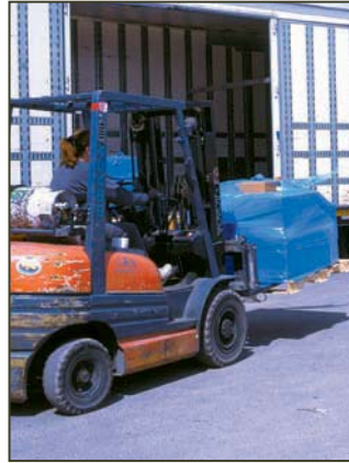
Side Door Loading