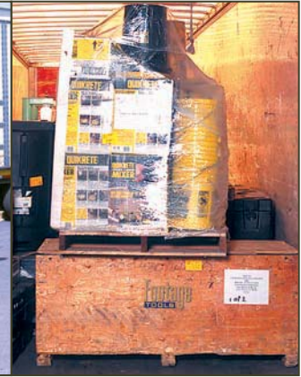
Constricted Space Loading