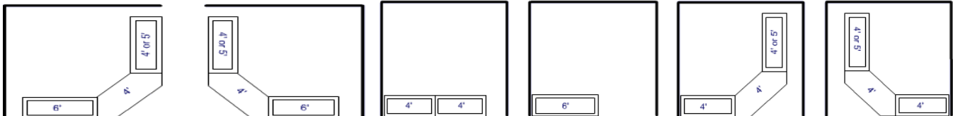
10' X 10' Booths