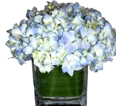
G2 6" tall x 5" wide $50.00 each