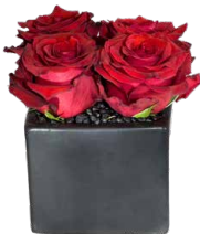
C 6" tall x 5" wide $60.00 each