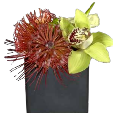
D 6" tall x 5" wide $65.00 each