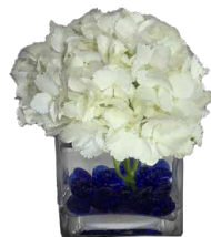
G1 6" tall x 5" wide $50.00 each