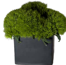
E 6" tall x 5" wide $65.00 each