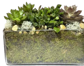
I2 7" tall x 7-8" wide $85.00 each