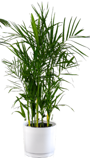
4 - 6' Bamboo Palm