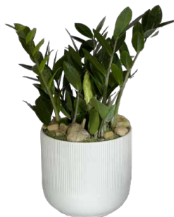
H 10-14" tall x 5-6" wide $65.00 each