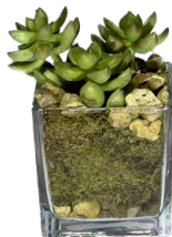
F2 6" tall x 4" wide $45.00 each