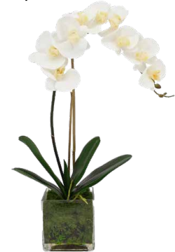
J 16-18" tall x 10" wide $95.00 each

Please note seasonal adjustments may apply to the above arrangements.