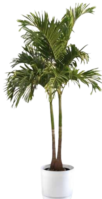
8 - 10' Andonidia Palm

*Discount pricing only applies to orders received and paid in full thirty days prior to Exhibitor Move In