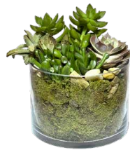
I1 7" tall x 5-6" wide $85.00 each