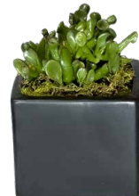
F1 6" tall x 4" wide $45.00 each