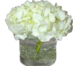
G3 6" tall x 5" wide $50.00 each