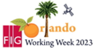
FIG Working Week 2023 Hilton Orlando Bonnet Creek Orlando, Florida Monday, 29 May – Wednesday, 31 May