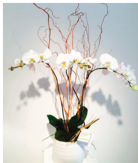
Double Phalaenopsis Plant Composition $125