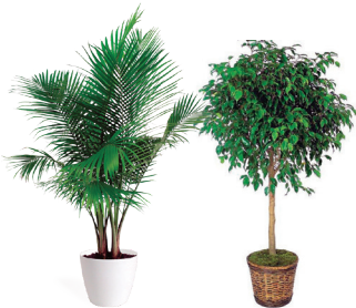
Standard 4' to 6' Green Plants