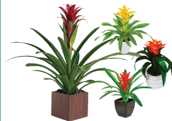
Bromeliads - 12" to 18" H $40 each