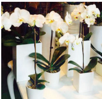
Single Phalaenopsis Plant Composition $75