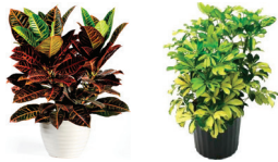
2' Green Plants