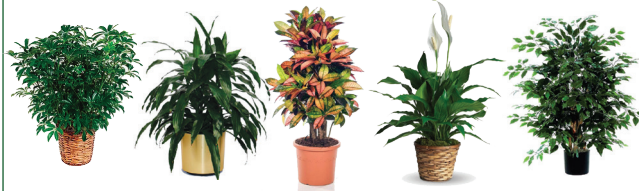
3' Green Plants