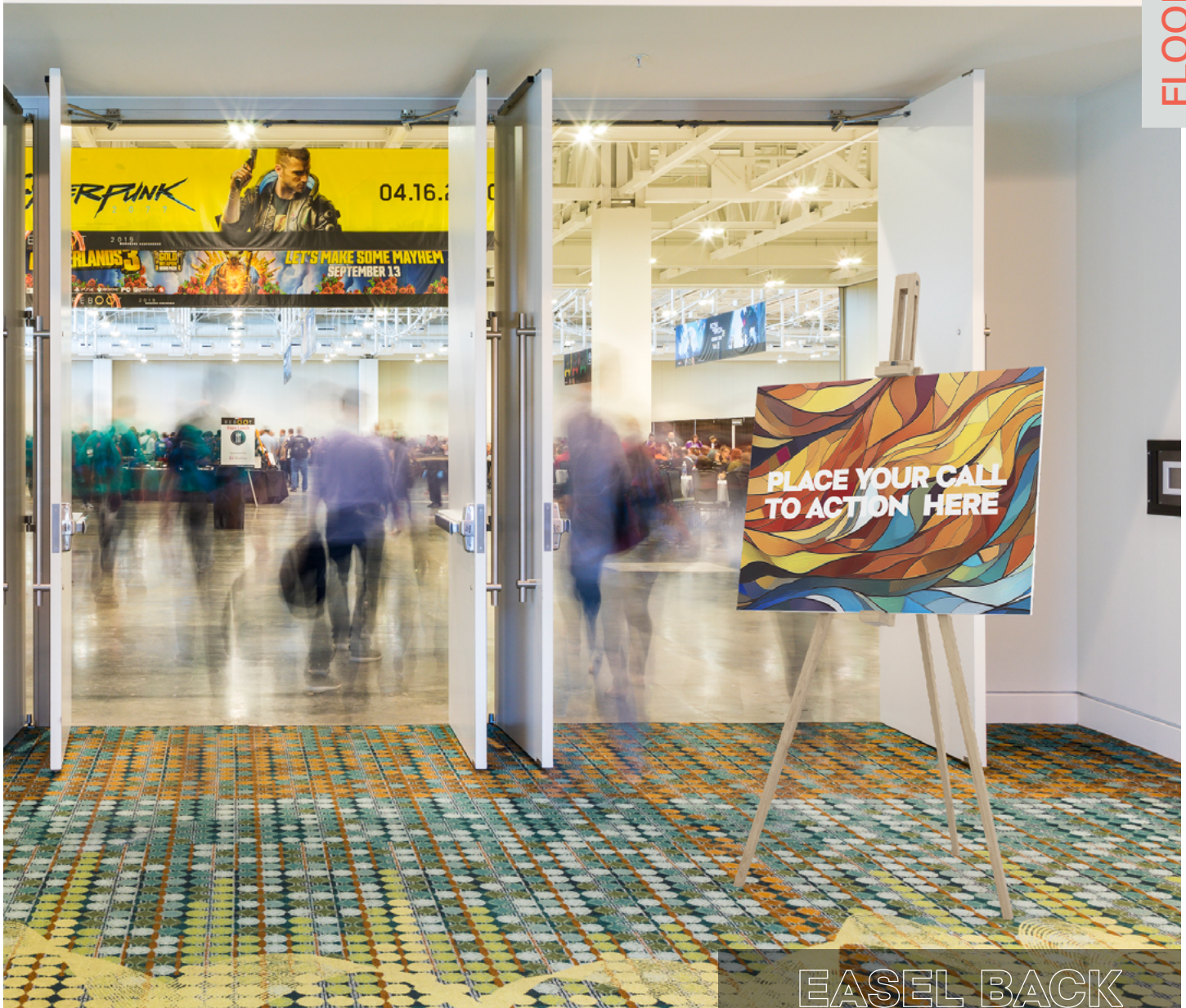
EASEL BACK SIGNAGE

“CREATE WITH THE HEART; BUILD WITH THE MIND.” - CRISS JAMI