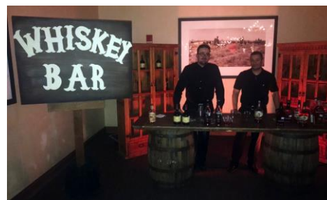
EXAMPLE OF WHISKEY TASTING BOOTH

NOTE: For Hosted Bars, we do recommend that you pre-determine either a budget for your bar or a maximum number of drinks to be served. Your bartender can check in with you as you get close to your maximum number. This will help ensure that your bar bill does not exceed your overall budget.