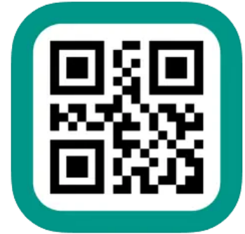
App Icon (not a real QR code)