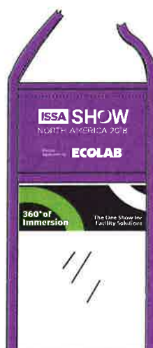
PURPLE Associate Supplier Associate Manufacturer Non-Exhibiting Manufacturer Press