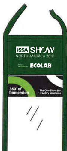
GREEN Distributor & Wholesaler