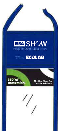
BLUE ECOLAB Official Sponsor