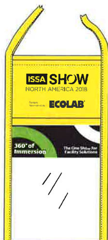
YELLOW In-House Service Provider