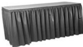
Table provided. 2' wide, 6' long, 2 1/2' high.

Intent: Other tabletop exhibits are entitled to a reasonable sight line. Displays are limited to the tabletop due to the nature and intent of the Tabletop Exhibit Space.