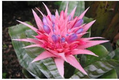
Bromeliad (Pink Guzmania)