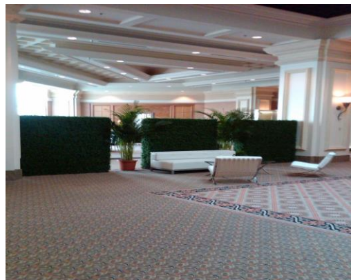
Boxwood Hedge Systems (39" H x 48" L x 9" D) and (72" H x 72" L x 9" D)