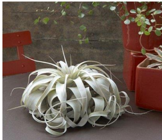
Xerographica (air plant)