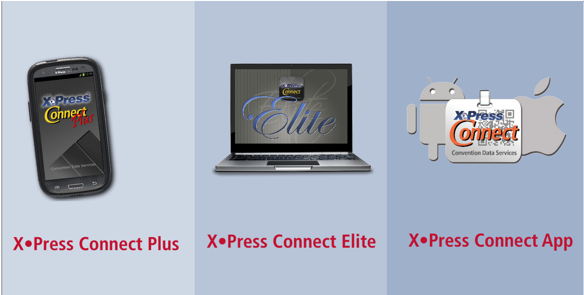
X•Press Connect Plus