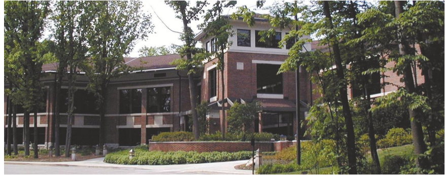
NFDA Headquarters | Brookfield, WI