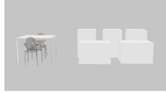
Renderings for illustrative purposes only. Slight variances may occur.

HEIGHT LIMIT: Nothing may extend above 6' from the floor including product, décor, display items, accessories, furniture, truss, lighting, A/V equipment or signage. <u>Hanging anything above the booth is prohibited.</u>