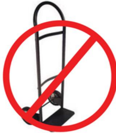
Two wheel dollies