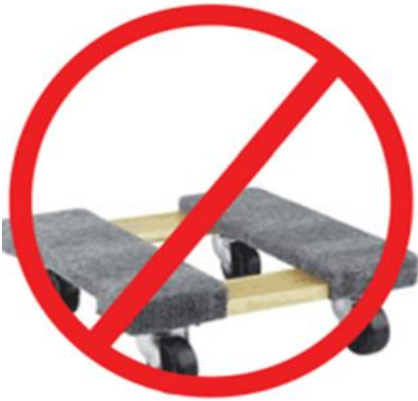
Four wheel dollies