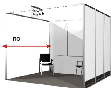
Option A - Corner - Open