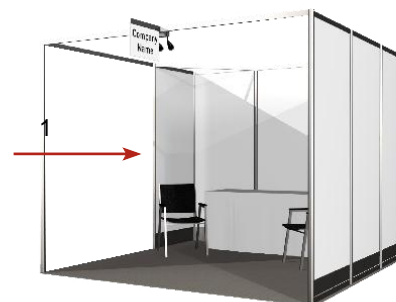
Option B - Corner Open with 1 panel