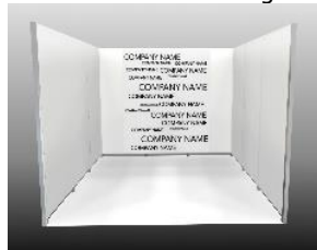
2M Fabric/Vinyl Graphic 77 1/2" wide x 96" high