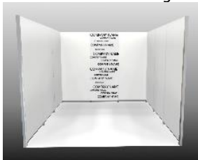
1M Fabric/Vinyl Graphic 38 3/4" wide x 96" high