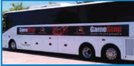
30'w x 2'h Exterior Bus Sign