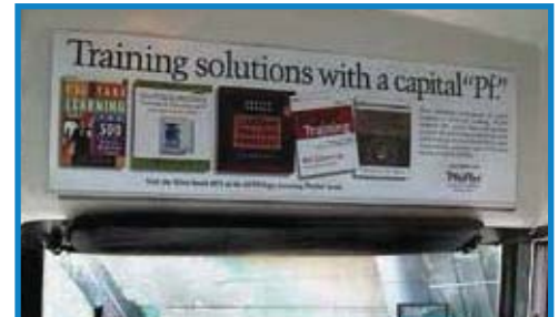
Header Sign facing passengers