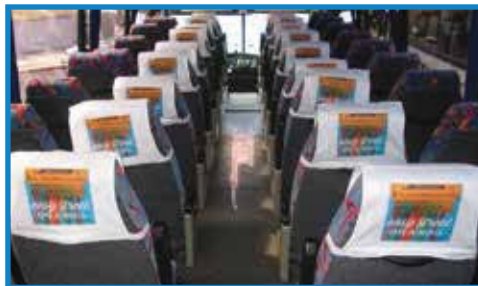
Headrest Covers ~ 20 per Bus