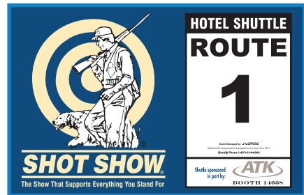
Logo on "On-Bus" Route ID Signs