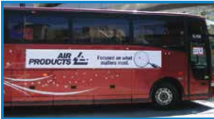
15'w x 2'h Exterior Bus Sign