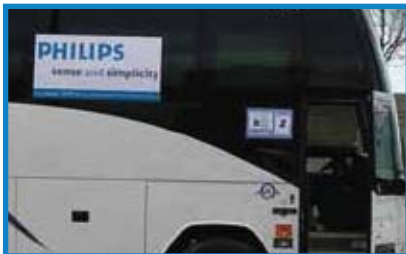
4'w x 2'h Exterior Bus Window Sign