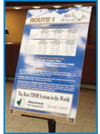
19"w x 6"h Full Color Ad on Hotel and/or Boarding Signs