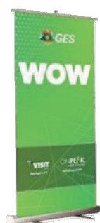
Roll-up Banner - Carry Bag included 85 cm W x 200 cm H

Add a selection of our banner option to your stand design to ensure your stand has a truly professional finish.