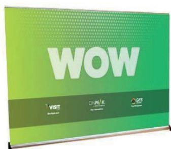
Roll-up Banner - Carry Bag included 270 cm W x 200 cm H